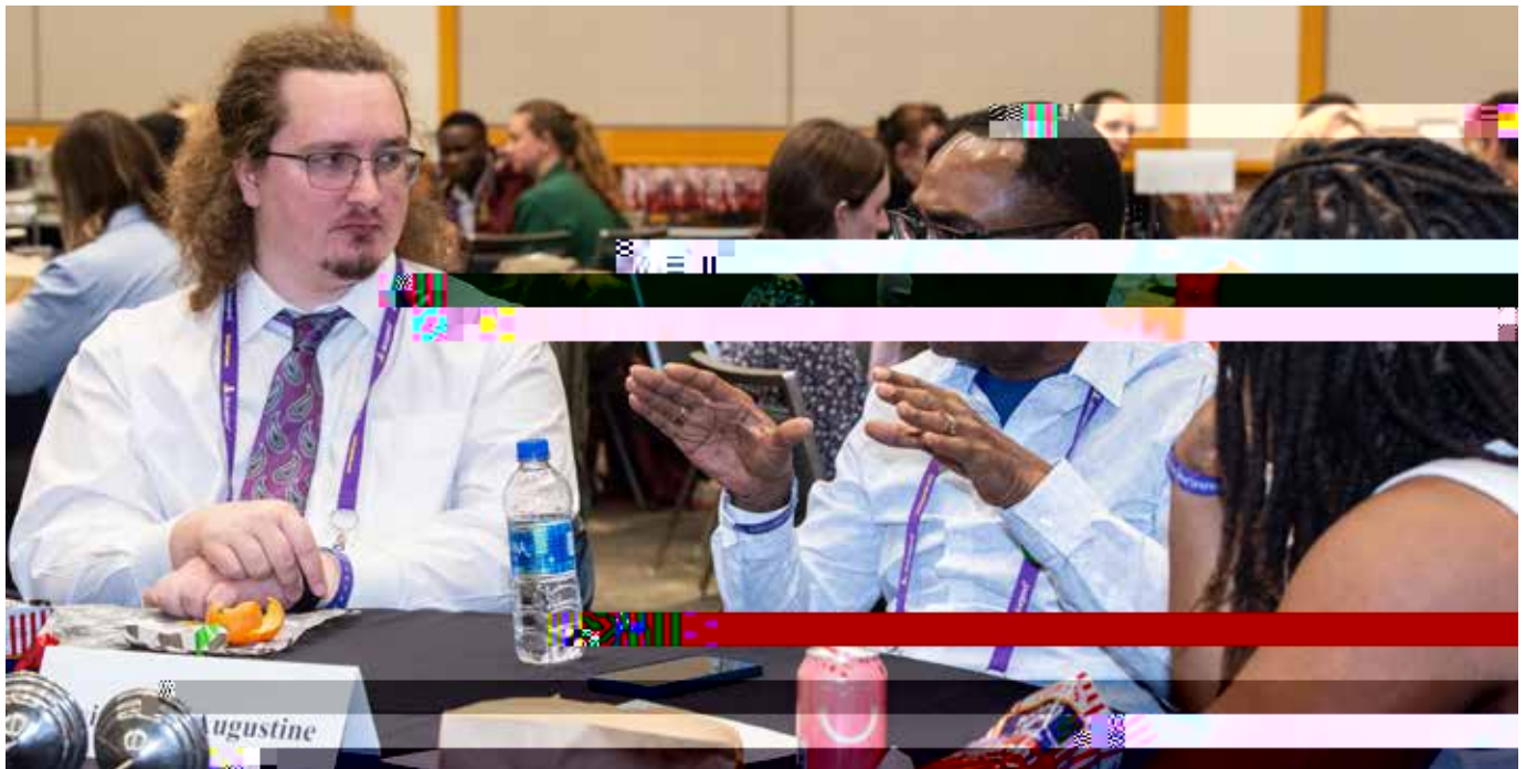
Augustine spoke passionately about his work in the federal government to a table full of interested attendees at IMMUNOLOGY2022™.

apply for the position (e.g., citizenship, internal or external applicants), then modify your résumé to fit the position and ensure that your educational background and skills match what the position requires. Be thorough!